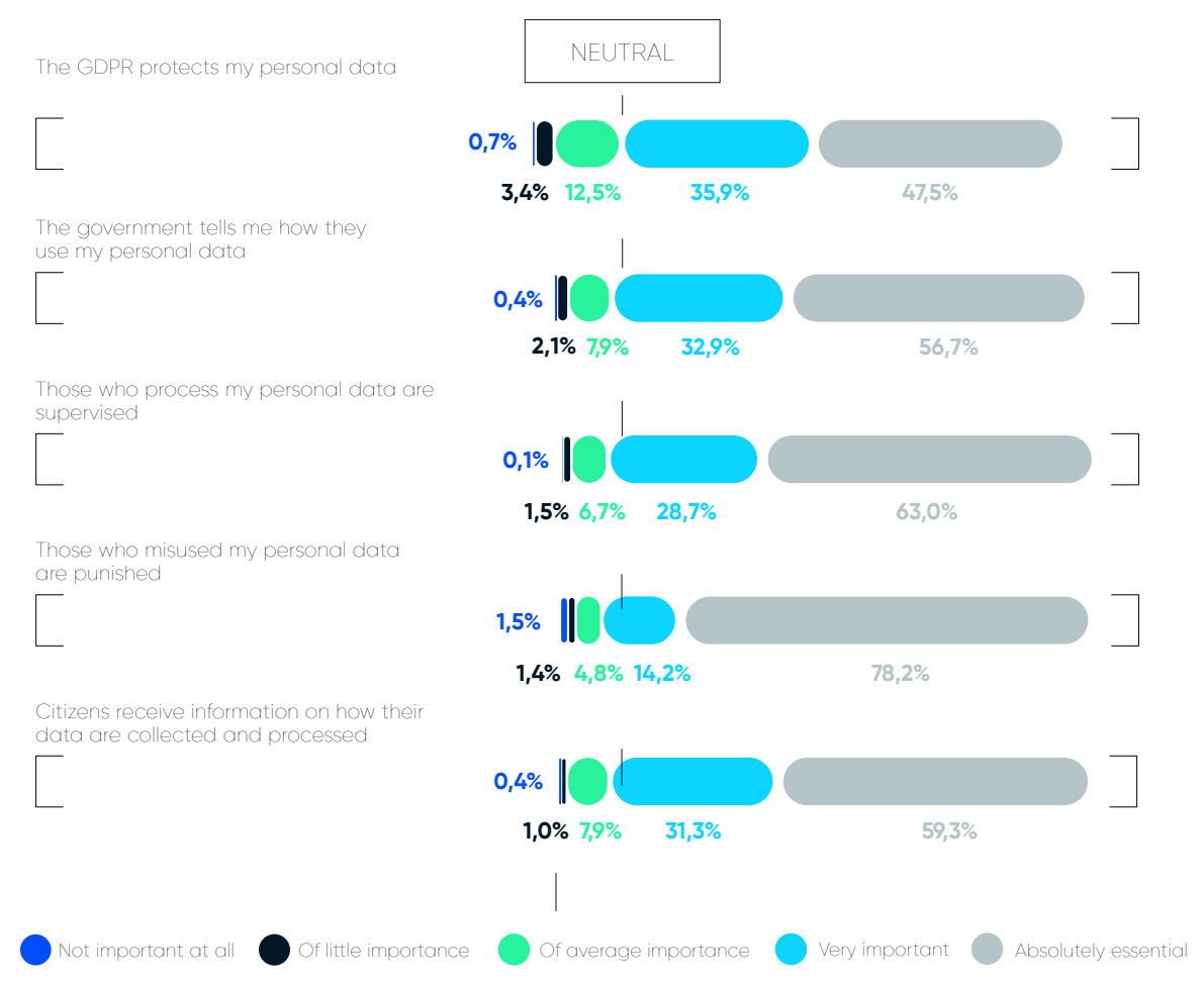
Figure 2: data protection